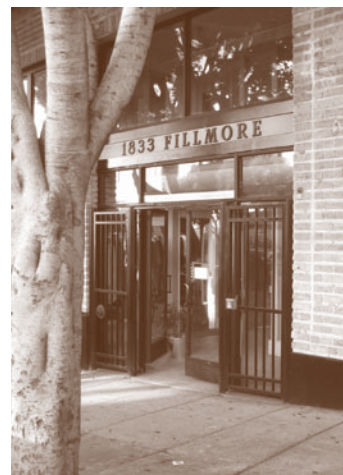
Plans are in place to move into 1833 Fillmore in early 2009.

pleasing, accessible and welcoming environment in which to provide and receive care. Plans are in place to break ground this Fall and move into 1833 Fillmore in early 2009. Please stay